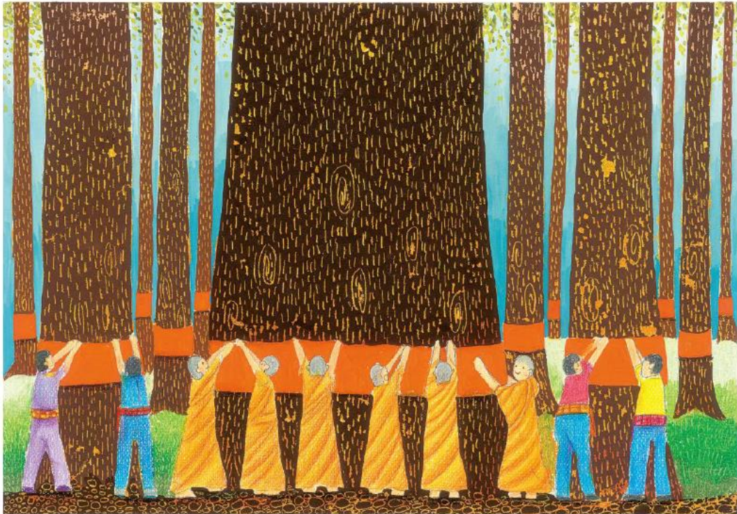
"eco together" - Planet Earth Grand Prix: "Buuat Pa" - The Buddhist ritual to conserve forest Kodchapan Malisorn (14)

KAO International Environment Painting Contest for Children