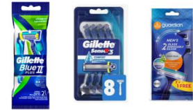
Disposable razors for male residents