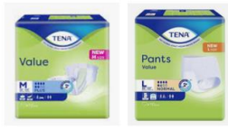
Adult Diapers (TENA brand) in sizes S, M & L