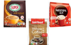
Coffee 3 in 1 packs